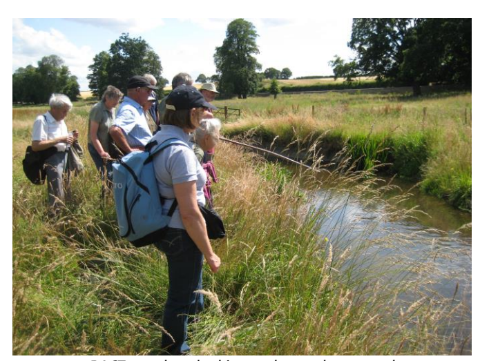
BACT members looking at the newly restored River Glaven on 19<sup>th</sup> July.

snakes and slow worms (legless lizards which look just like a snake). As if all this was not enough for much of the morning a pair of buzzards were soaring majestically over the marsh – something that would have been unthinkable just a few years ago. It really was the most fantastic place for watching wildlife and proof that all the work we have carried out on our nature reserve over the years has had a very beneficial effect.