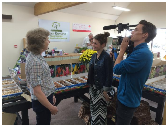
Paris Back stars in the Post Office film

Following that we seemed to fast be becoming Norfolk's new media stars! If you've read a newspaper or turned on the local news in the last few weeks you may have found it hard to avoid us! You could have seen us in the EDP, heard us on BBC Radio Norfolk with Wally Webb or watched us on Look East. We were also chosen to be featured by the Post Office as the 3000<sup>th</sup> Post Office branch to be open on a Sunday. Two days after we opened to the public, we were visited by their press team who interviewed both us and our customers, and put together a video which was sent out to the national media. We were featured in The Independent, on the BBC News business website, on the ITV pages and on Yahoo and BT websites. For a short time, Bergh Apton seemed to be the words on everyone's lips!