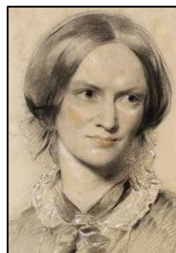
George Richmond's (possibly idealised) portrait of the "Jane Eyre" author Charlotte Bronte was done on 1850, five years before her death at the age of 38. It hangs in the National Portrait Gallery.