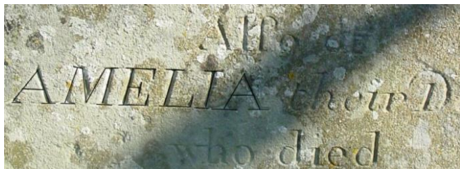
Close-up view of the spelling of Robert Woor's youngest daughter.