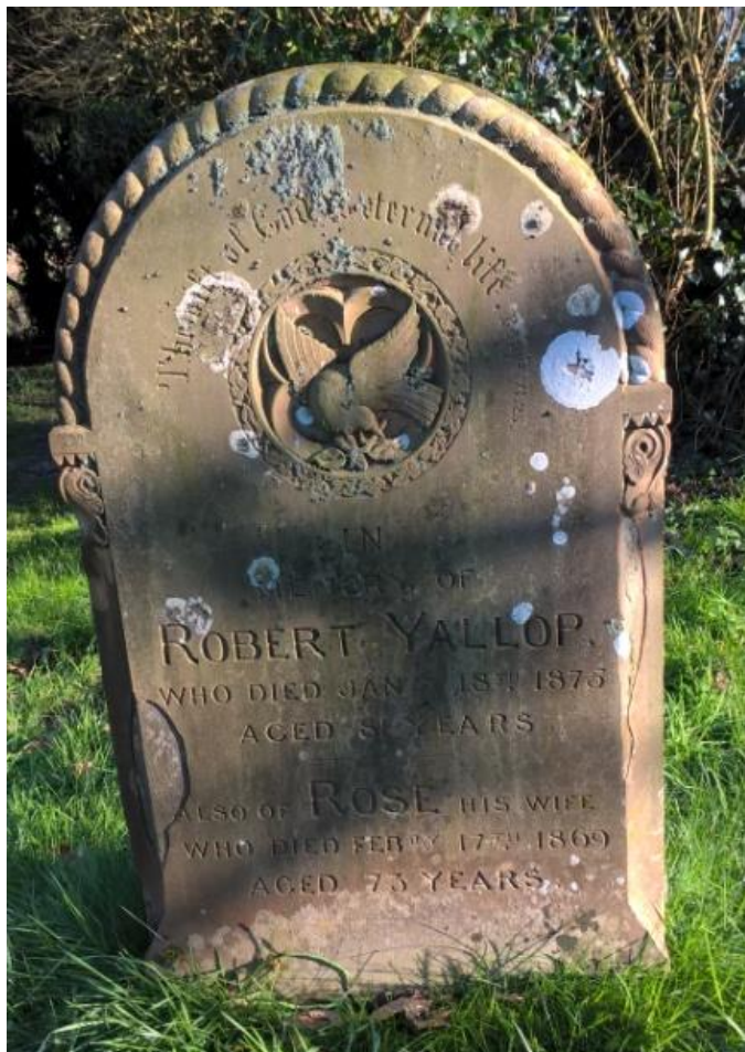
The grave of three Yallop children who died in the same week of October 1851.